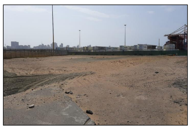
3) The construction site is clearly demarcated- August 2020