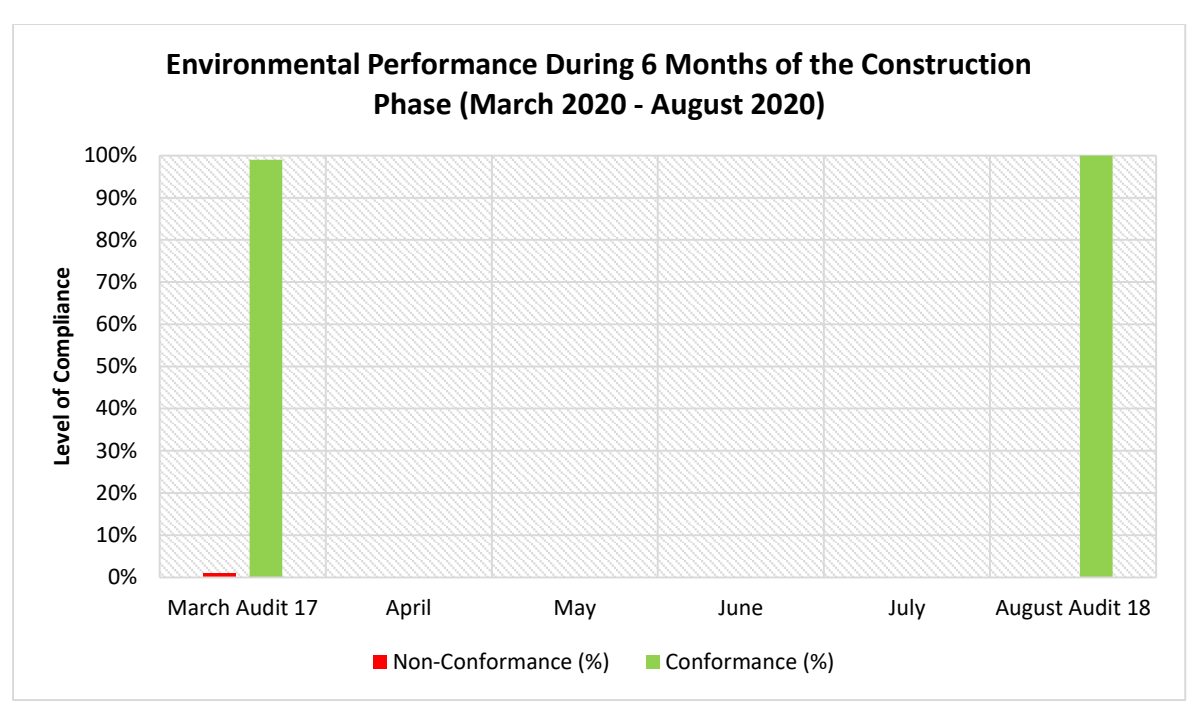
Figure 1: Breakdown of the compliance achieved for reporting period (March 2020 – August 2020)