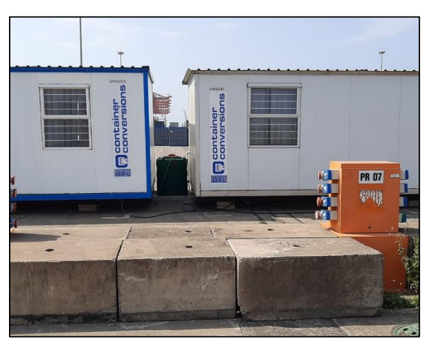
9) Installation of a wastewater tank at the kitchen - August 2020.