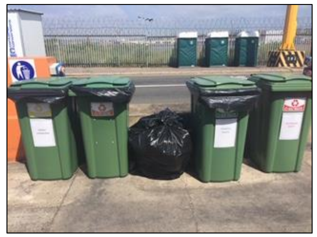
6) Provision of recycling bins on site- March 2020.