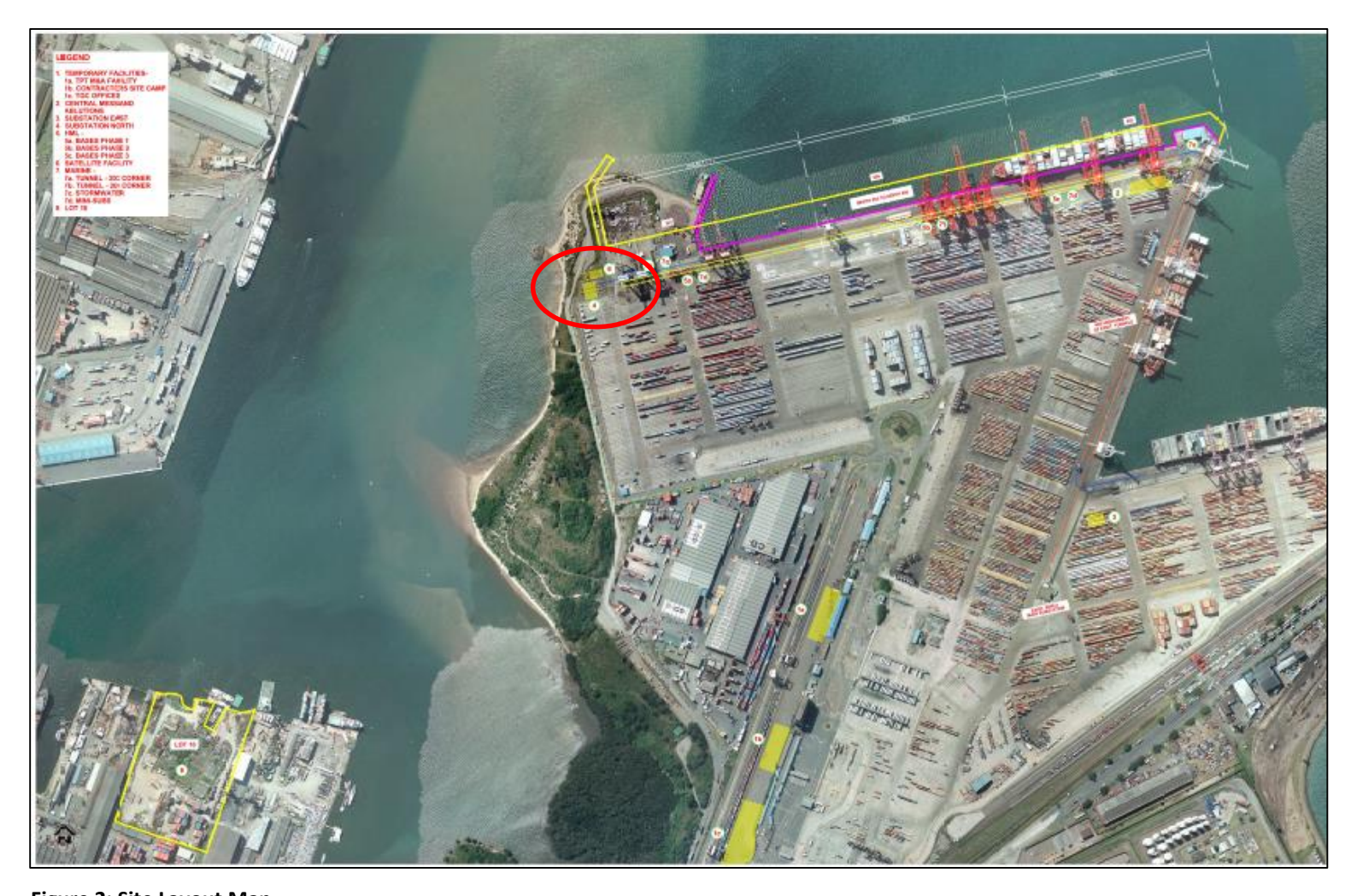
Figure 2: Site Layout Map