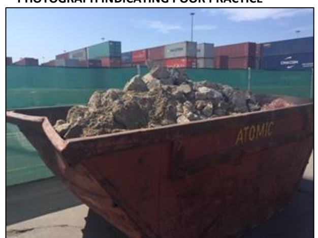
10) Rubble and construction waste observed on site for more than 90 days – March 2020