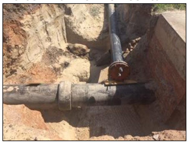
1) Asbestos pipe to be removed from site –March 2020