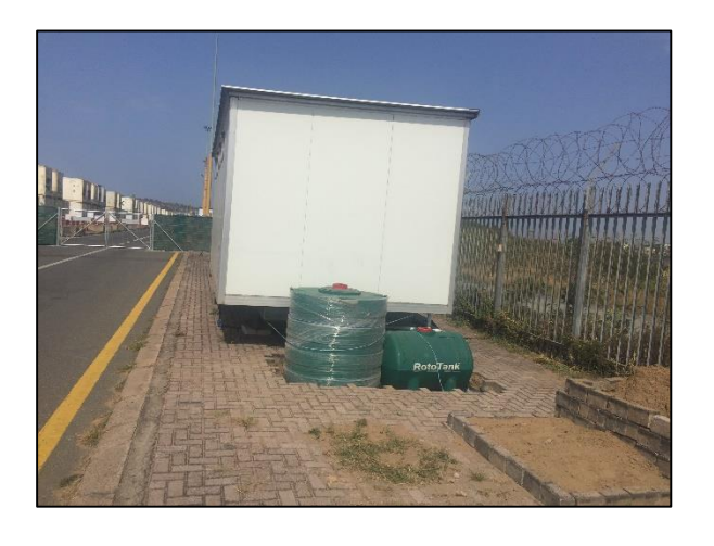
8) Installation of wastewater tanks at the shower room – August 2020