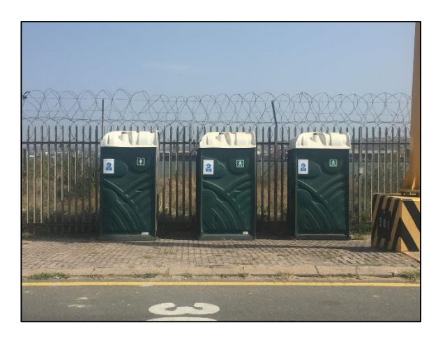
7) Ablution facilities provided on site - August 2019.