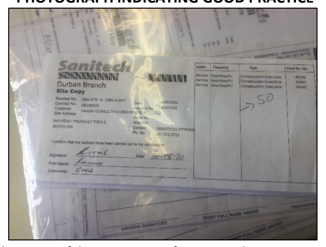
4) A copy of the waste receipt from Sanitech- August 2020.