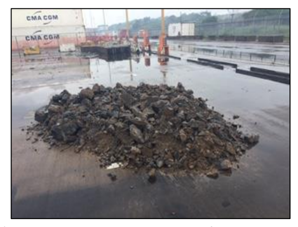
15) Rubble to be contained or removed from site-December 2019