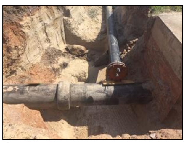
6) Laydown of pipes on site – February 2020.