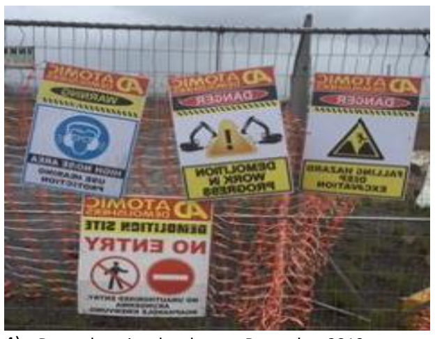
4) December site shutdown – December 2019.