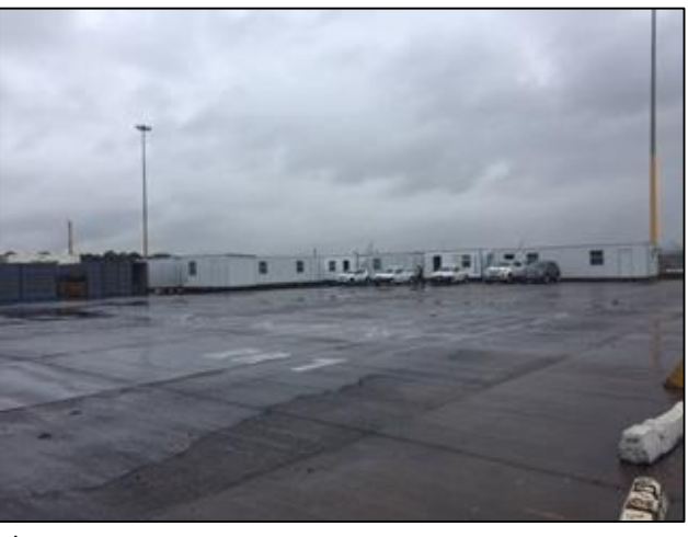
The establishment of the main contractor's camp-December 2019.