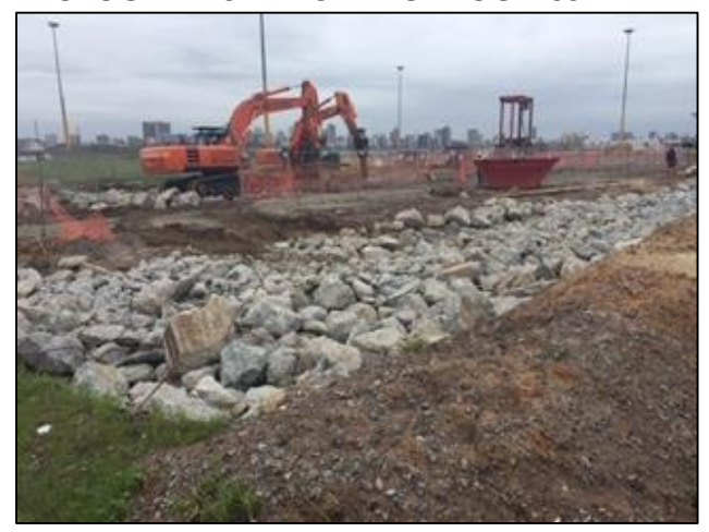
1) Laydown of pipes on site -November 2019.