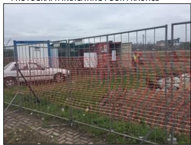
13) Establishment of Atomic Demolishers site office-November 2019.