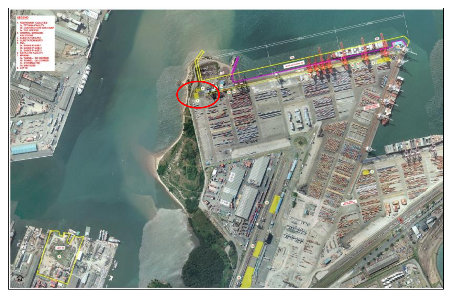
Figure 2: Site Layout Map