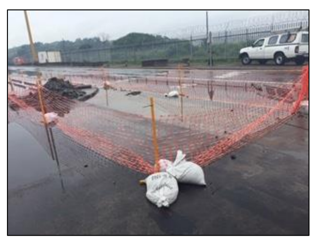
3) Construction of driveway to the HCP JV site camp – December 2019.