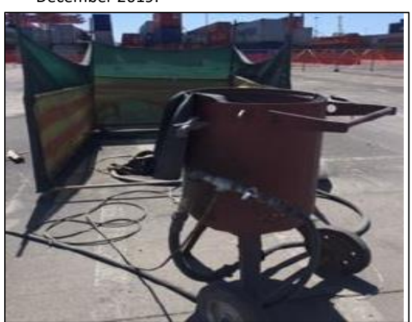
5) Sand blasting activities at the HCP JV site camp – January 2020.